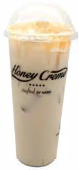
Classic Jelly Milk Tea $8