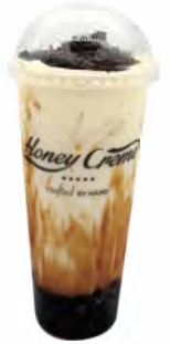
Bobo Oreo Milk $9.5