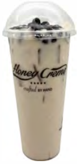
Classic Pearl Milk Tea $8