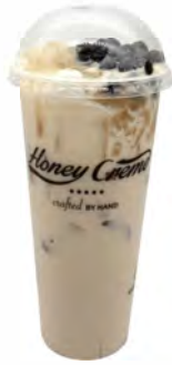
Bobo Combo Milk Tea $9