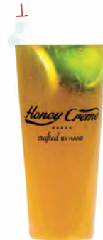
Lemon Levy $9