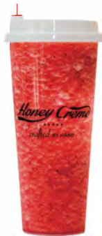
Poppy Strawberry $9