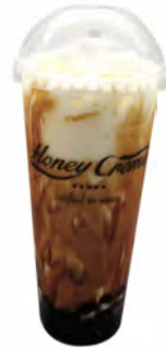
Bobo Brown Sugar Milk $9