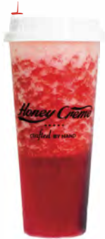
Wonder Watermelon $9