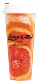
Grapefruit Paradise $9